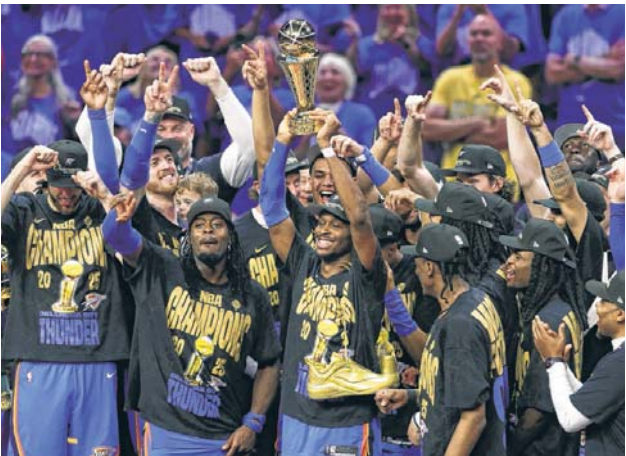
CHAMPS: Oklahoma City defeated the Indiana Pacers, 103-91, to win its first basketball title since moving from Seattle. A14