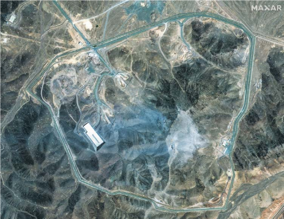
Satellite images collected by Maxar Technologies show the Fordow underground nuclear complex in Iran before the weekend's U.S. airstrikes, top, and after the bombing, above, which shows several large holes punched in a ridge over the underground installation.

Nuclear program is likely set back, but the fate of enriched uranium isn't clear