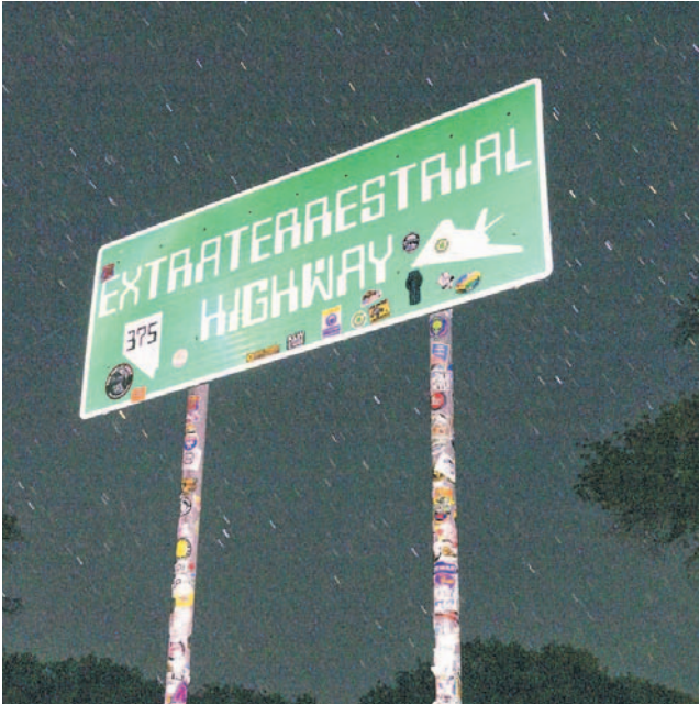
Top and above right, driving along the Extraterrestrial Highway in Nevada. Above left, bikers gathered for a parade during the 2025 UFO Fest in Oregon.